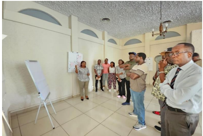
Photo 11: Photos of the prioritization session, countries discussing.

As a last step, countries also identify joint activities, such as enhancing the capacity of countries in the CBIT project cycle, including elaborating the requirements of the terminal evaluation and CBIT phase two for countries implementing phase one.