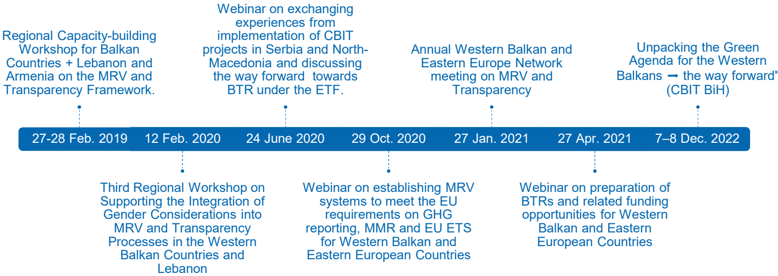
Unpacking the Green Agenda for the Western Balkans