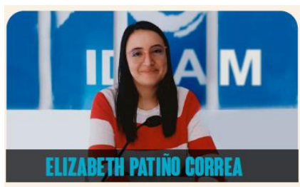
Deputy Director of Environmental Studies