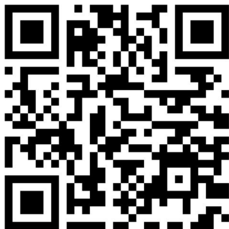
Climate Transparency Colombia

If you want to learn more about our methodology, scan these QR codes and discover it: