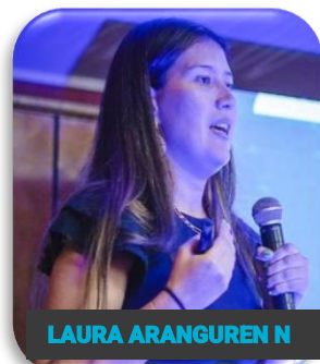
Coordinator of the GEF CBIT Colombia Project