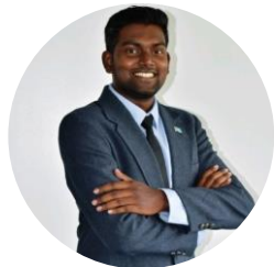
Pacific Transparency Coordinator

Please reach out to us for any question, comments or suggestions!