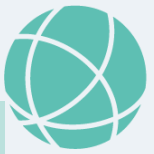
Figure 1 Key components of institutional arrangements